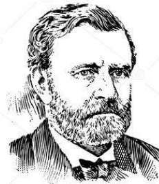
Ulysses S. Grant